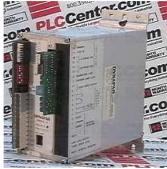
Representative Photo. Item you receive may vary.

Estimated Retail Price: $719.00 Last Update: 2/21/2008